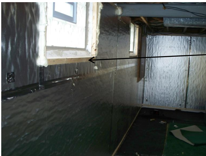
Basement Wall before insulation.