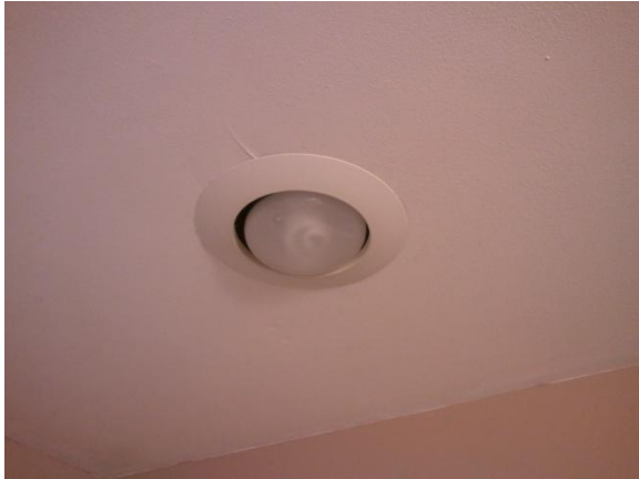
Typical Recessed Light