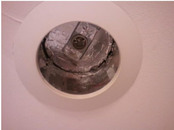
Typical Recessed Light with bulb removed