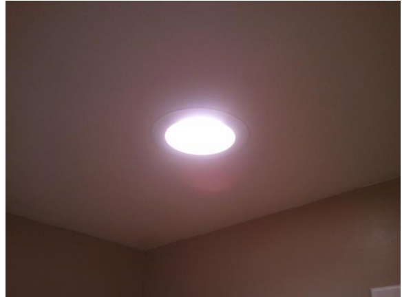
LED light pattern is very similar to typical flood light and completely airtight!