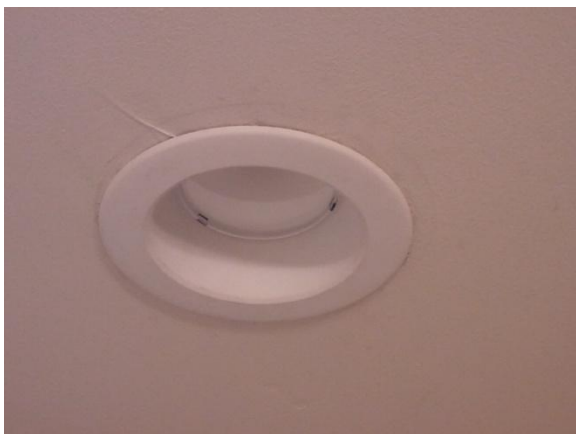
Trim kit sealed to drywall