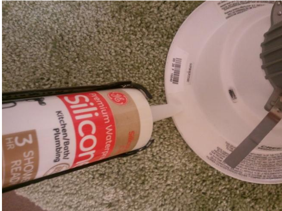
Caulk the back side of trim kit and expand spring loaded arms