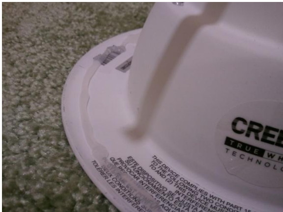
Continuous bead of caulk