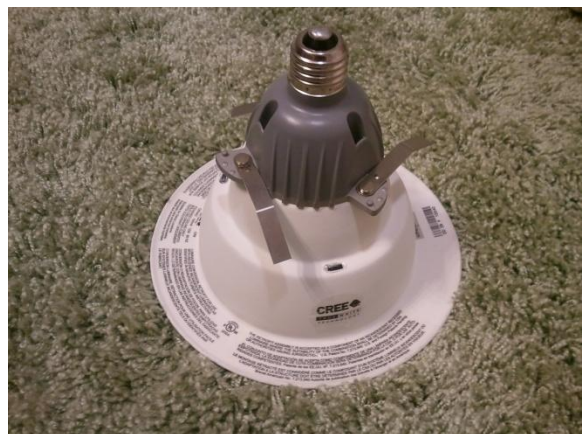
Dimmable LED recessed light with integrated Trim Kit 2