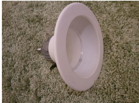
Dimmable LED recessed light with integrated Trim Kit 1(65 watt replacement @ 10.5 watts)