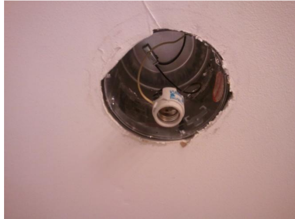
Recessed light not sealed to drywall