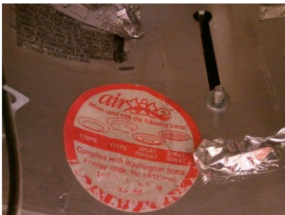
Airtight Recessed Light with a gaping hole next to sticker???